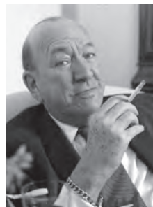
Noël Coward. 1972.

For further information on Noël Coward's life and work, visit noelcoward.com .