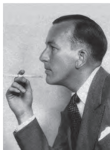
Noël Coward. 1930.

Noël Peirce Coward was born in 1899 and made his professional stage debut as Prince Mussel in The Goldfish at the age of 11, leading to many child actor appearances over the next few years. His breakthrough in playwriting was the controversial The Vortex (1924) which featured themes of drugs and adultery and made his name as both actor and playwright in the West End and on Broadway. During the 1920s and 1930s, Coward wrote a string of successful plays, musicals and intimate revues including Fallen Angels (1925), Hay Fever (1925), Easy Virtue (1926), This Year of Grace (1928) and Bitter Sweet (1929). His professional partnership with childhood friend, Gertrude Lawrence started with the musical Revue, London Calling (1923) and was followed by Private Lives (1931) and Tonight at 8:30 (1936).