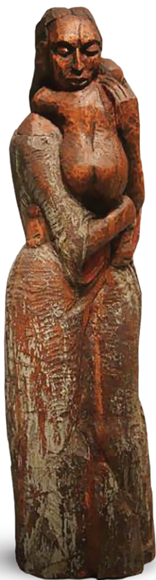
Untitled (Woman and Child) - Selma Burke