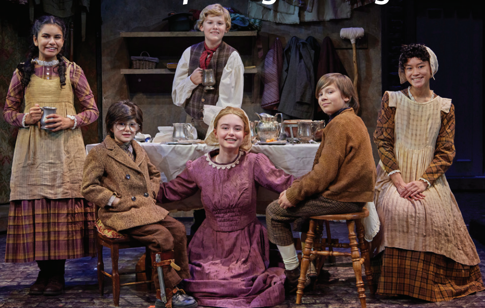
The young company cast of A Christmas Carol (2023).