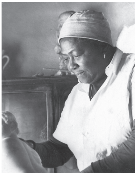
Selma Burke working in New Hope studio, no date.

S elma Hortense Burke was born Dec. 1, 1900 in Mooreville, North Carolina, the seventh of 10 children. Her mother was a respected teacher; her father was an African Methodist Episcopal Zion minister. The family's belief that education and knowledge were the keys to freedom from bondage had started with Selma's grandfather, a slave of Stonewall Jackson. Her grandfather had been allowed to attend Berea college in Kentucky. He became a minister and, after the end of the Civil War, received an advanced degree in theology from Livingstone College in North Carolina. Selma and her siblings all had professional careers.