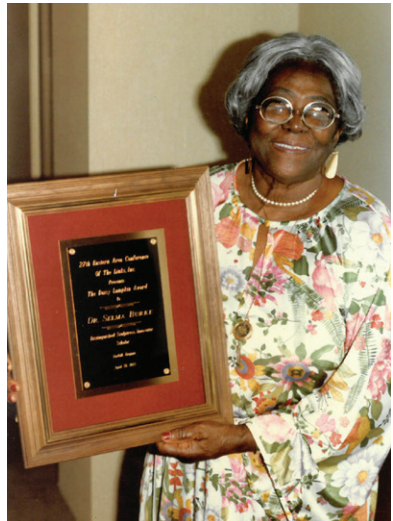
Selma Burke at Eastern Chapter Links Conference, Virginia, 1983.

Theatre Calgary gratefully acknowledges the support provided by the City of Calgary through Calgary Arts Development, the Government of Alberta through the Alberta Foundation for the Arts, the Government of Canada through the Canada Council, Canadian Heritage, and all corporate and private contributors.