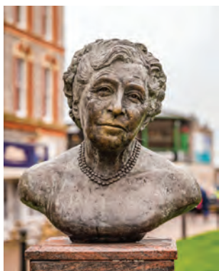
Bust of Agatha Christie in Torquay, UK

Sampled from About Christie ( agathachristie.com )