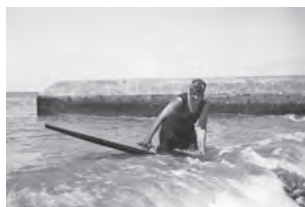
Agatha Christie surfing, 1922