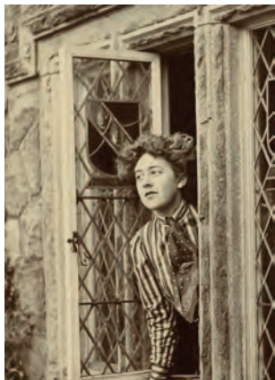
A young Agatha Christie

In 1947, Agatha was approached by the BBC to write a radio play for the 80th birthday of Queen Mary, who was an avid admirer of her work. The result was Three Blind Mice , which ultimately became The Mousetrap . The world's longest running play opened in October 1952 in Nottingham, before transferring to the Ambassadors Theatre in the West End in November with Richard Attenborough and Sheila Sim as the stars. In September 1956, it became the longest running play in British history. And in 1974, it moved to the St Martins Theatre where it has been ever since (save for an enforced hiatus during the corona virus pandemic).