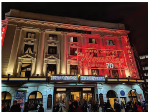
The Mousetrap at St Martins Theatre, 2023